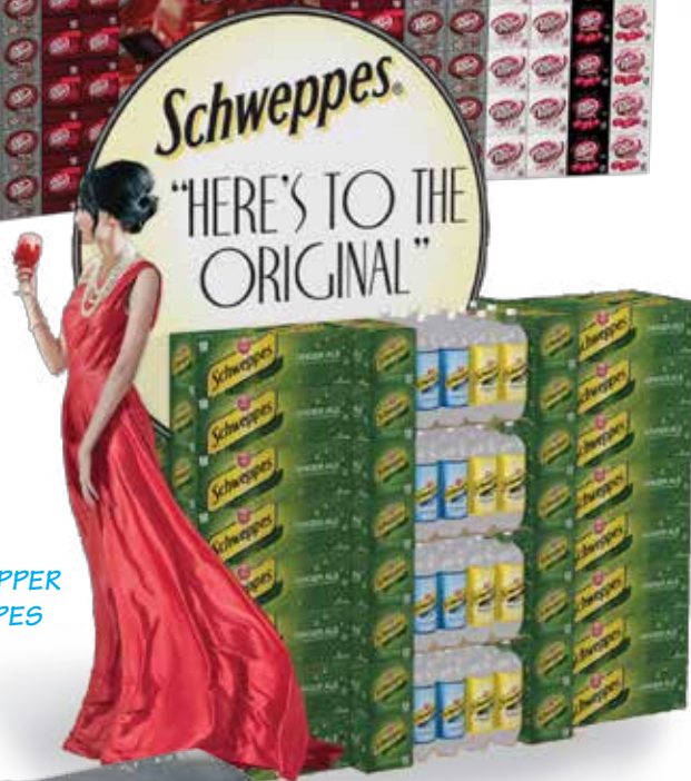
LOBBY DISPLAY FOR DR PEPPER SNAPPLE GROUP/SCHWEPPEES