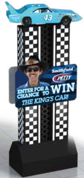
DISPLAY FEATURED IN NATIONAL BROADCAST COMMERCIAL