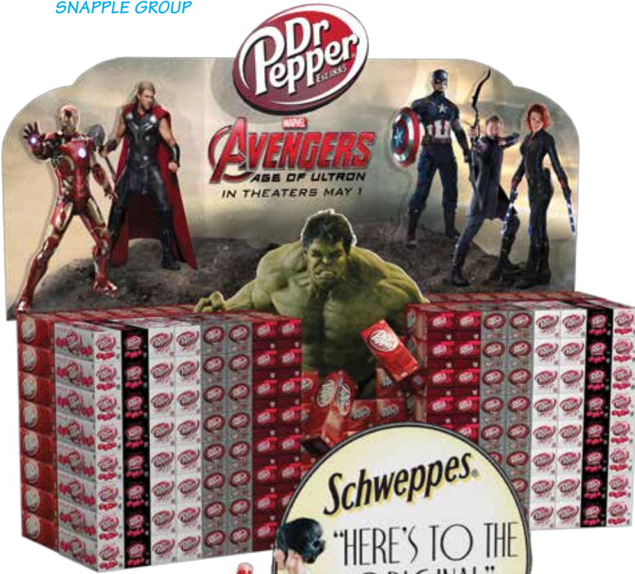
LOBBY DISPLAY FOR DR PEPPER SNAPPLE GROUP