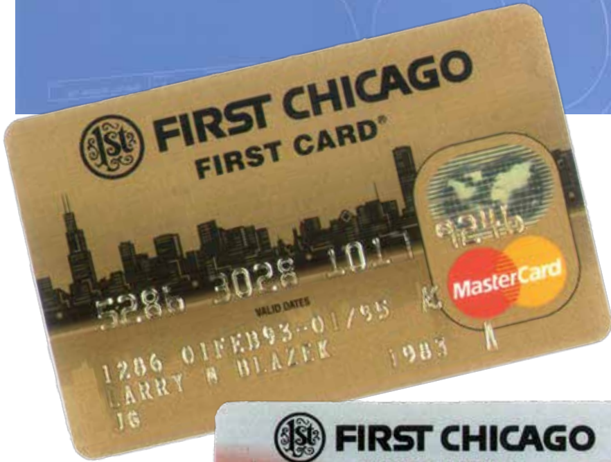
CREDIT CARD DESIGN